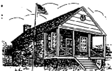
Callands Courthouse & Gael - 1773

Although it is not widely known, Pittsylvania County has its own cradle of the American Revolution -- the old courthouse at Callands where on January 26, 1775 numerous inhabitants voted to elect a Committee of Safety to "defend their liberties and their properties at the risk of their lives." In short, they took the bit in their teeth to defy the King.