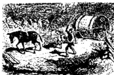
Rolling tobacco to seaport to be exported to England.

Many of you readers of "The Packet" may not smoke...and some of you probably believe tobacco is a health hazard...But before you condemn it as an evil that should never have been grown --- you