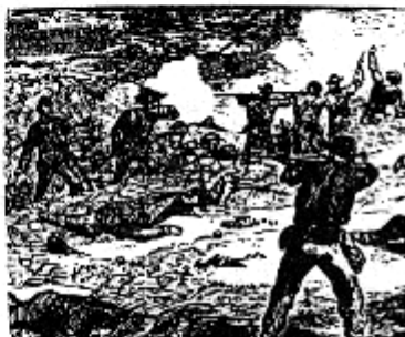
Confederates try to hold off attack by Yankees at Saltville.

The handsome New York cavalryman felt up to the task and approached it with alacrity. After all, he was fresh off a successful Southern tour with General William Tecumseh Sherman's wrecking crew.