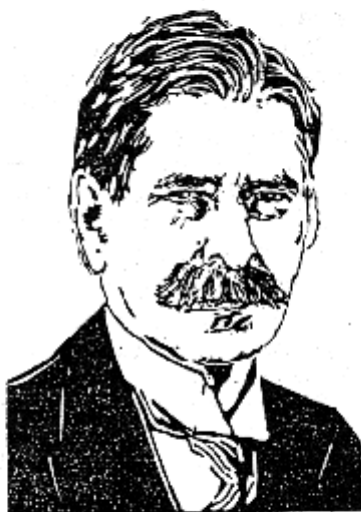
Claude A. Swanson 1862-1939