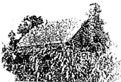
This old photo shows Rachel Donelson's birthplace before it was destroyed by fire. (Cornfield is seen in front of cabin.)